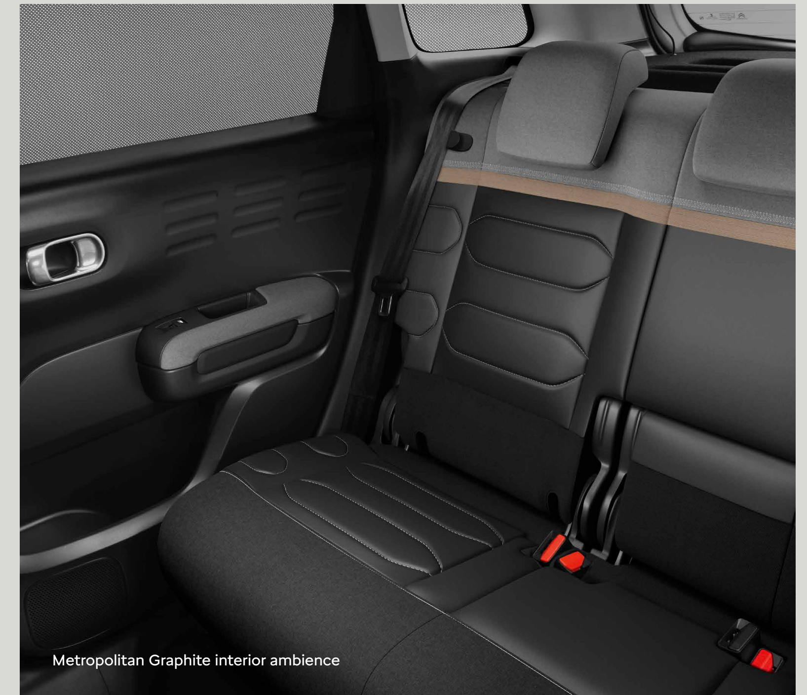
Metropolitan Graphite interior ambience